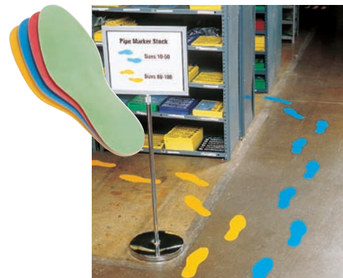
Quickly and easily demonstrate the most efficient workflow procedure using these Removable Footprints.