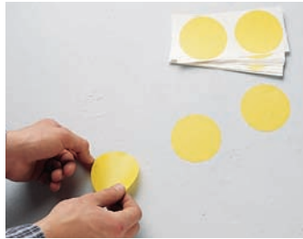
Self-sticking Aisle Marking Dots are designed for easy hand application.