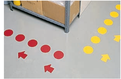
Aisle Marking Dots are perfect for marking short aisles, or around machines, equipment and storage areas.