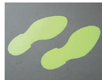
"Glow-in-the-Dark" Photoluminescent Footprints

10+ hour glow life ASTM E2072-00/E2073-02/ E2030-02 ASTM/E162/E648/E662, SMP 800C IMO Resolution A. 752(18) ISO/CD 15370 PSPA Standard 002 Part 2 1993 Class A Rev. 2: 09/99