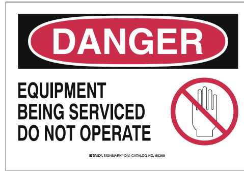
7 x 10 - 50269