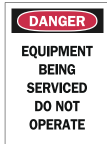
5" x 3½" - 66008 7" x 5" - 66009