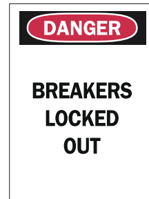
5" x 3½" - 66004 7" x 5" - 66005