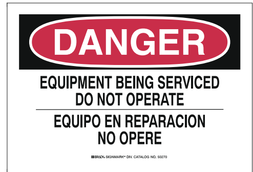
7 x 10 - 50270