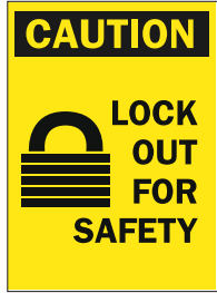
Fiberglass - 65571 Plastic - 22909