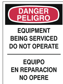
5" x 3½" - 50277 7" x 5" - 50279