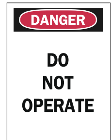
5" x 3½" - 66006 7" x 5" - 66007