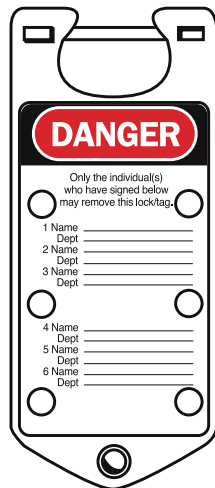
Reverse Side #2